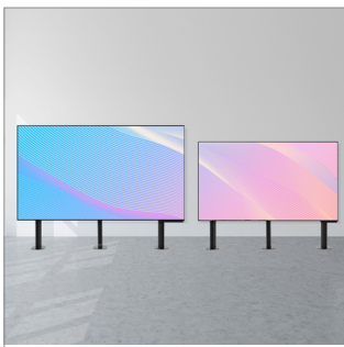
Configurations for multiple screen sizes available