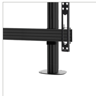
Small footprint ideal for retail applications where floor space is limited