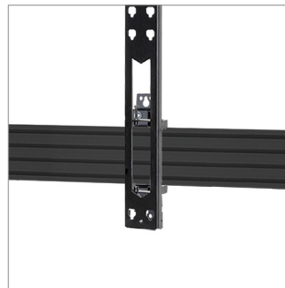
Simple 'hook-on' installation