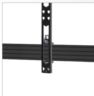
Simple 'hook-on' installation