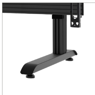
Floor base utilises adjustable levelling feet, ideal for uneven surfaces