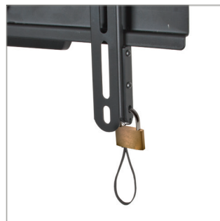
Interface arms can be padlocked to help prevent unauthorised removal of screen (padlock not included)