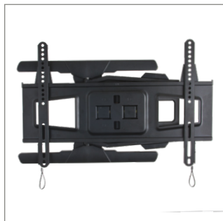
Features 3 pivots pots for easy screen adjustment, folds flat to the wall when not in use